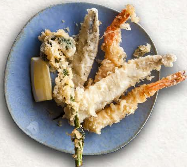
Seafood tempura (5 pcs.) / 12.5

Lightly battered sweet potato, pumpkin & broccolini served with tempura sauce