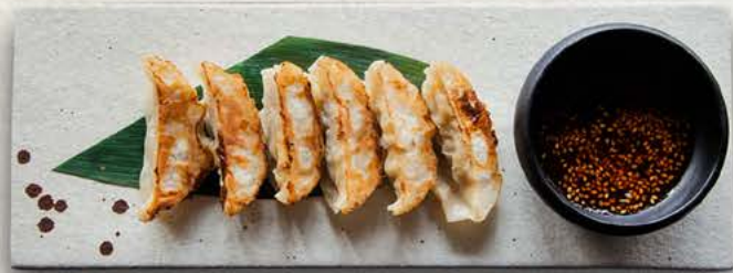
Pork gyōza / 9.5 Vegetable gyōza / 9.5 VG

Pan-fried Japanese-style dumplings served with housemade gyōza sauce