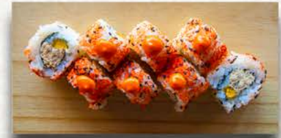
Salmon & avocado roll (8pcs.)

Cooked tuna salad and mango rolled in sesame seeds, chilli powder and spicy sauce