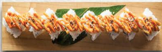
Curry chicken roll (8pcs.)