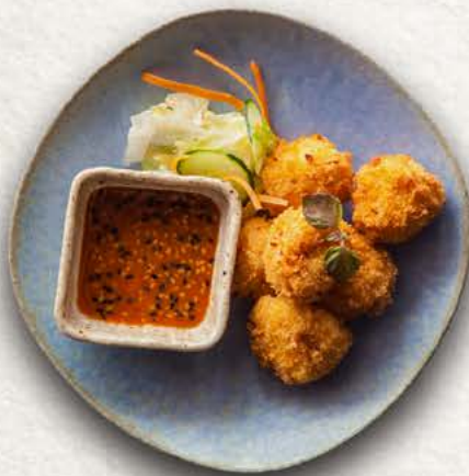
Tofu-yaki VG (6pcs.) / 8.5

Breaded tofu based vegetable balls with house made spicy sauce