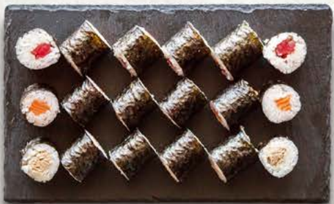
Tuna roll (6pcs.)