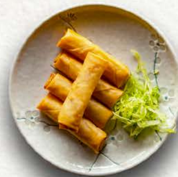
Spring roll VG / 8.0

Scallops wrapped in kataifi with flying fish roe and miso aioli sauce on top