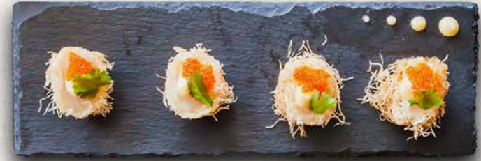
Scallop kataifi /14.0

Please inform our friendly staff regarding allergy condition.