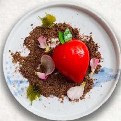
Vanilla ice cream (1 scoop) / 4.0

Strawberry mousse and guava jelly, lime crunch, citrus almond sponge, guava purée