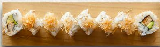
Teriyaki tofu roll (8pcs.)

Katsu chicken and avocado rolled in spicy sauce, curry mayo, spring onion and sesame seed