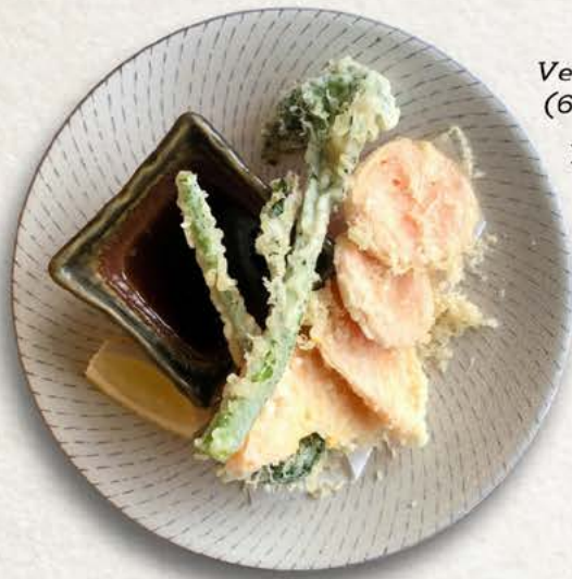
Vegetable tempura (6 pcs.) VG / 10.0

Lightly battered sweet potato, pumpkin & broccolini served with tempura sauce