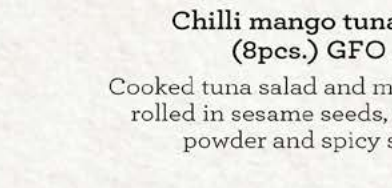
Chilli mango tuna roll (8pcs.)

Cooked tuna salad and avocado rolled in flying fish roe