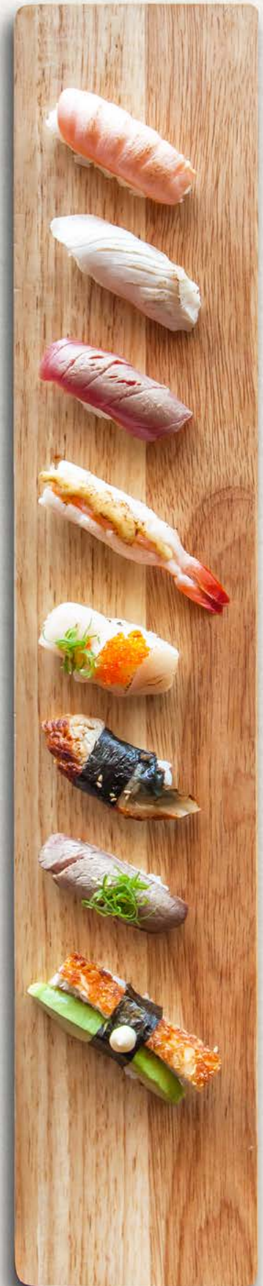
Chicken katsu nigiri / 6.0 (2 pcs.)