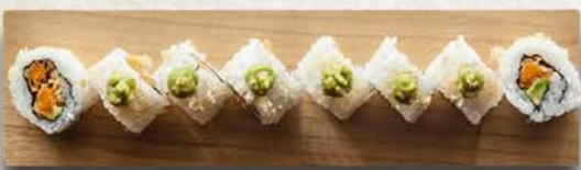
Pumpkin roll (8pcs.)

Marinated tofu and avocado rolled in sesame seeds, kataifi and served with teriyaki sauce