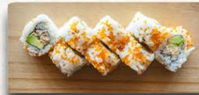
Cooked tuna & avocado roll (8pcs.)