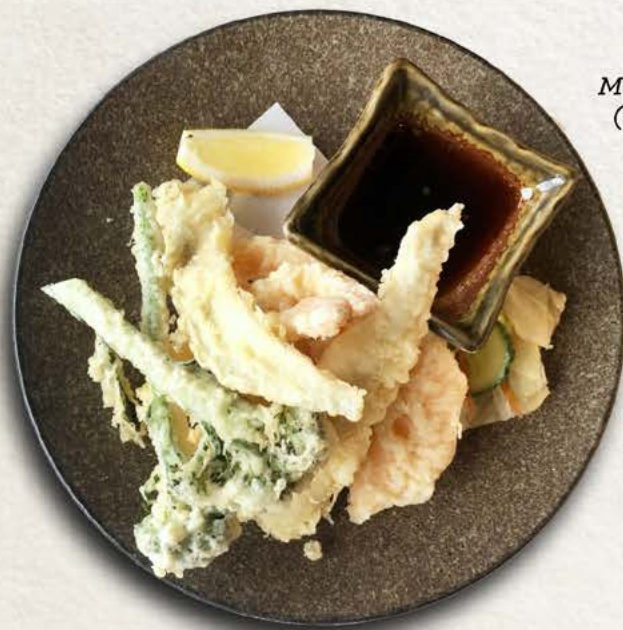
Mix tempura (10 pcs.) / 21.5

Lightly battered garfish and prawn served with tempura sauce