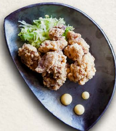
Karaage / 9.8 Spicy karaage / 10.0

Japanese style deep fried chicken served with Japanese mayonnaise