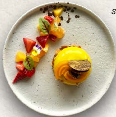
Sunkissed / 15.5

Milk chocolate mousse, Passionfruit cream, Hazelnut sponge, coconut biscuit, mango & lime jelly and white chocolate glaze