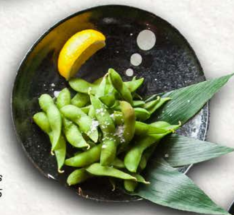
Edamame beans VG / GF / 5.5