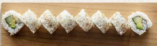
Avocado & cucumber roll (8pcs.)

Pumpkin tempura and avocado rolled in tempura flakes and guacamole